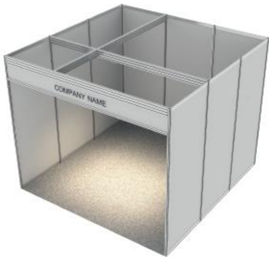
One open side