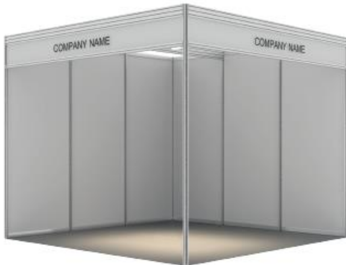
Two open sides